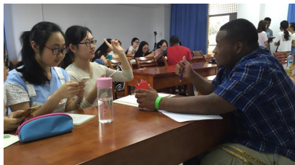
Discussion session in a class with Xiamen University students.