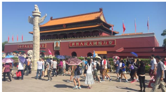
Tian'anmen Square at the heart of Beijing.

Information will be updated on https://www.asurams.edu/globalprograms