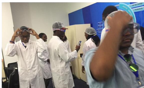
Gearing up for a tour in a P&G Hair Care Product Plant in Jiangsu.