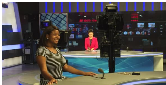
In a Beijing TV studio when the news broadcast is live on air.